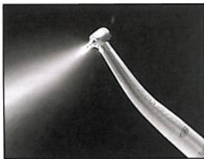
READER ENQUIRY 168

The range promises powerful and reliable performance, with a three-year warranty on straight and contra-angle models. All of the models are thermo washer disinfectable and sterilisable, and come with a scannable, etched, data matrix code as standard for traceability.